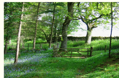
The straight trunk and tangle of branches from the pollarded tree by the wall show how wood has been harvested in the past.