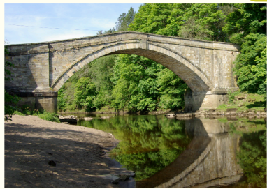
Cross Featherstone Bridge as it arches over the South Tyne

A series of tracks and footpaths lets you explore the woods, moors and countryside of this historic and unspoilt area.