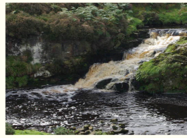
The waterfall at Lynnshield.

Welcome to the National Trust's Bellister Estate.