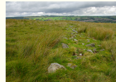
This line of stones that you see by the side of the path on Broomhouse Common is all that remains of a farm over 2000 years old.