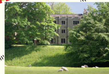
Bellister Castle across the fields. It is said to be haunted by the 'Grey Man' the ghost of a minstrel killed by the Lord of Bellister's hunting dogs.