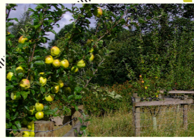
The National Trust community orchard in Park Village is a haven for wildlife